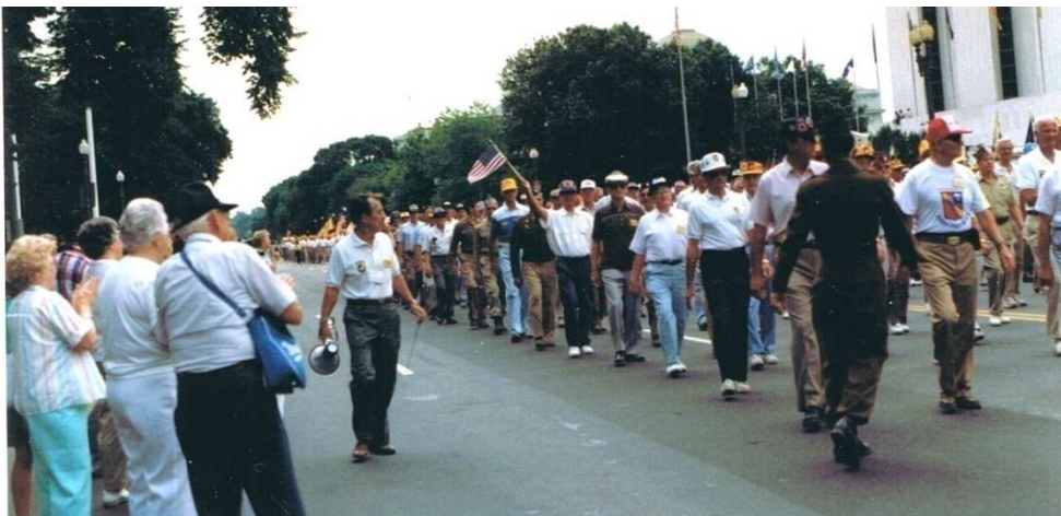
50 th Airborne Anniversary Parade, Washington DC, July 1990. Flag waver is me.