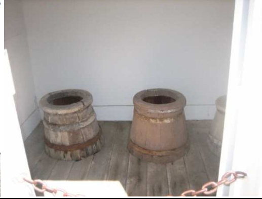
President Abraham Lincoln's bathroom (Springfield, Illinois, 1860).